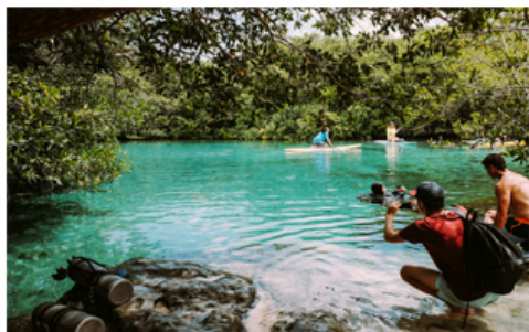
Cenote within walking distance