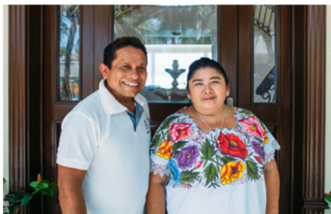
Caretakers on site for meals/drinks/cleaning