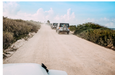
Explore the biosphere jungle area