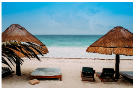
All the gorgeous beaches surrounding us