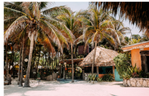
Tulum has endless shops/bars/food/beaches

Villa Escapar is a beachfront luxury villa located in Tankah, just 15 short minutes from Tulum. With it's 5 bedrooms, 5 1/2 baths, formal dining, infinity pool, rooftop terrace, 4 palapas, 2 covered terraces overlooking the beach, caretakers cottage, covered parking and more - Villa Escapar can accommodate anything from large groups of multiple families to a romantic getaway for 2. All rooms are fully air conditioned, and we also offer WIFI, Netflix, televisions in all rooms, speakers throughout the home and pool for music, and caretakers that can help you with anything!