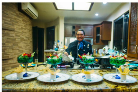
Full Chef service is available

Also, please check out our 5 star ratings on Homeaway/VRBO property #287565