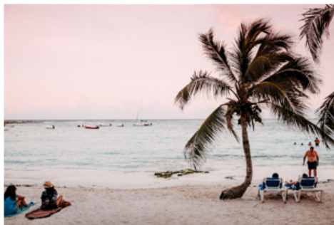
Tulum beaches/shopping/bars min. away